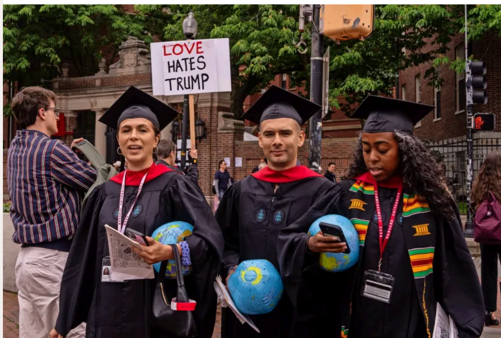
Anti-Trump protestors on campus at Harvard University

Not, of course, that he has sympathy for Maga anti-science sentiment. He’s perturbed that the Trump administration is taking steps to bar Harvard from receiving federal research funding. “Harvard’s entire science, engineering, medical, public health departments depend to a large extent on federal funding,” he says. “The damage could be catastrophic.”