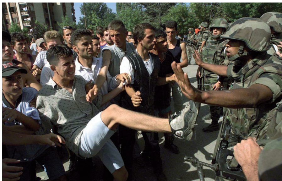
Peacekeepers, such as NATO in Kosovo, are highly successful, an example of how reason has tamed violence.

Could an expansion of reason really have driven down violence? Consider the statements of the great men of a century ago, such as Theodore Roosevelt, who wrote: “I don’t go so far as to think that the only good Indians are dead Indians, but I believe nine out of ten are, and I shouldn’t like to inquire too closely into the case of the tenth”, or the young Winston Churchill, who cheerfully carried out atrocities in British colonies in Asia and Africa and wrote: “I hate Indians.